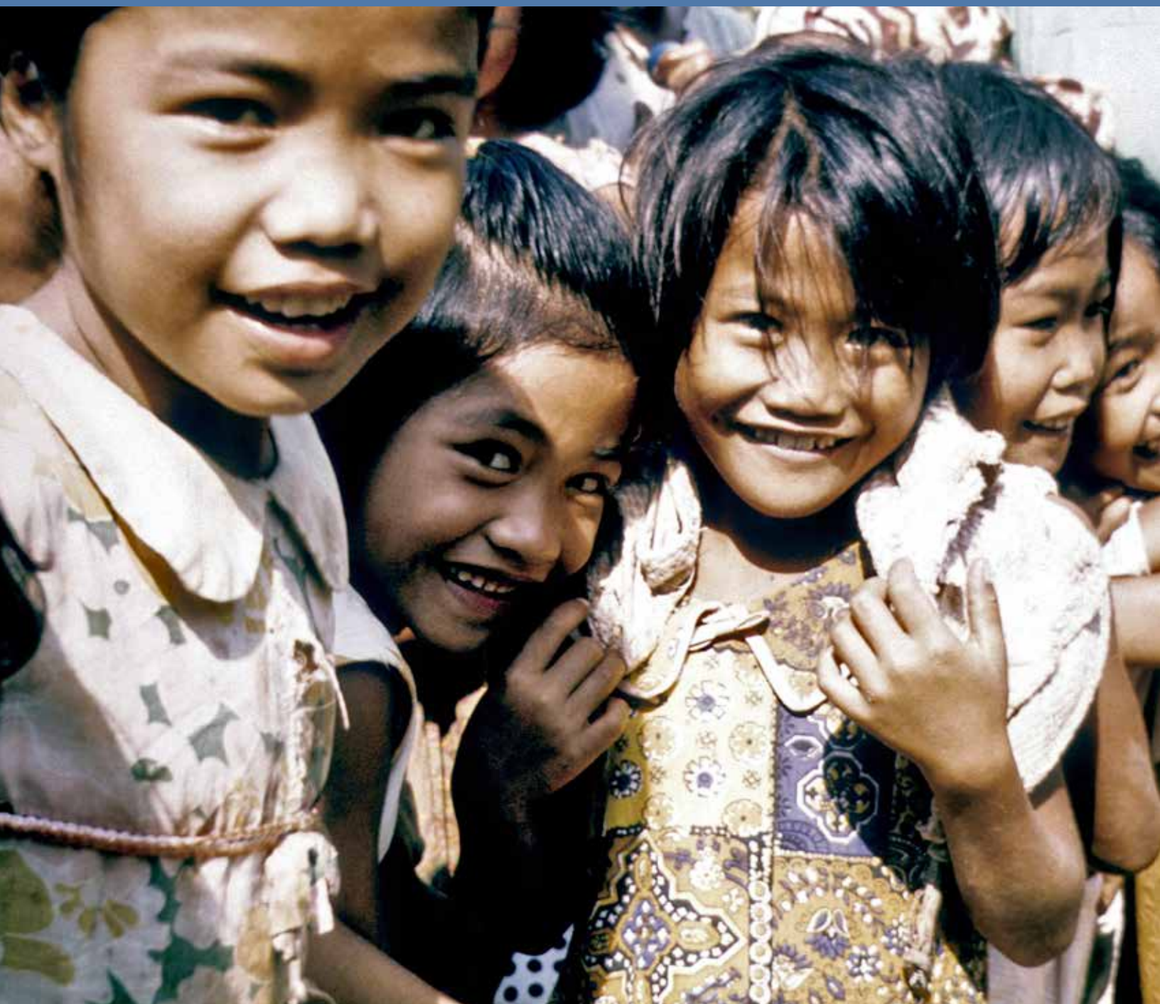
Children listening to a talk at a mobile health unit in the Philippines