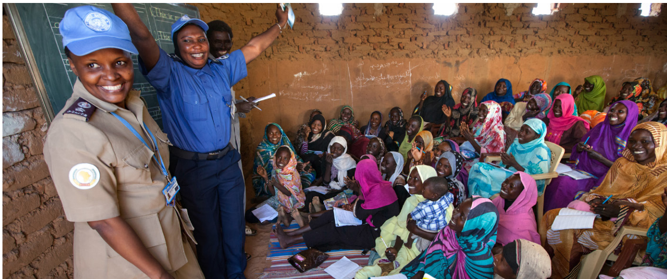
Women in Abu Shouk camp in Darfur attend English classes provided by the UNAMID police.